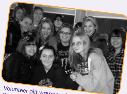
Volunteer gift wrappers from Southbrook Middle School model bows