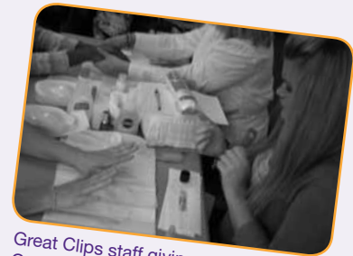
Great Clips staff giving manicures to Outpatient clients

☀️ The staff of Great Clips volunteered their time to give free haircuts and manicures to clients of our Outpatient program.