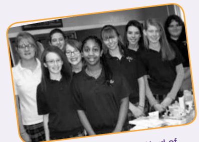
Holiday gift wrappers from Word of God School