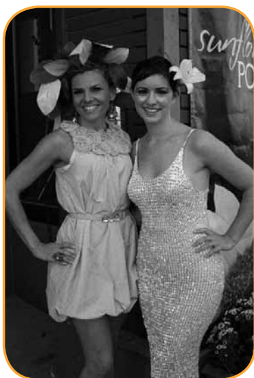
Sunflower POWER models greet guests at Perlora Leather

A good time was had by all who attended Sunflower POWER at Perlora Leather in the Strip on a balmy evening in September as part of celebrations around the country in honor of National Recovery Month .